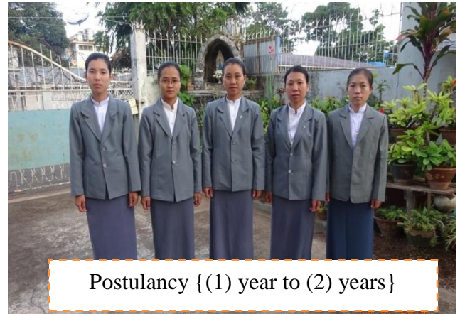
Postulancy {(1) year to (2) years}