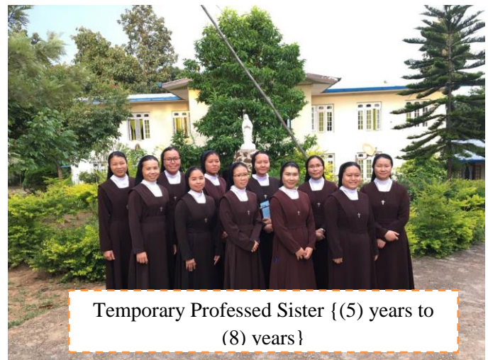
Temporary Professed Sister {(5) years to (8) years}