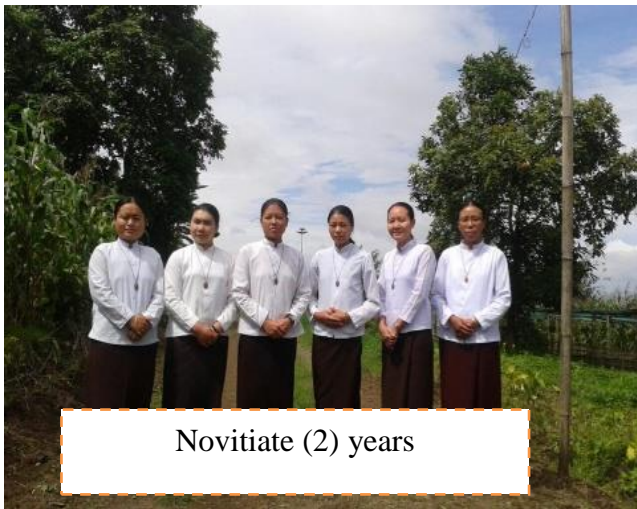
Novitiate (2) years