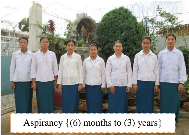
Aspirancy {(6) months to (3) years}