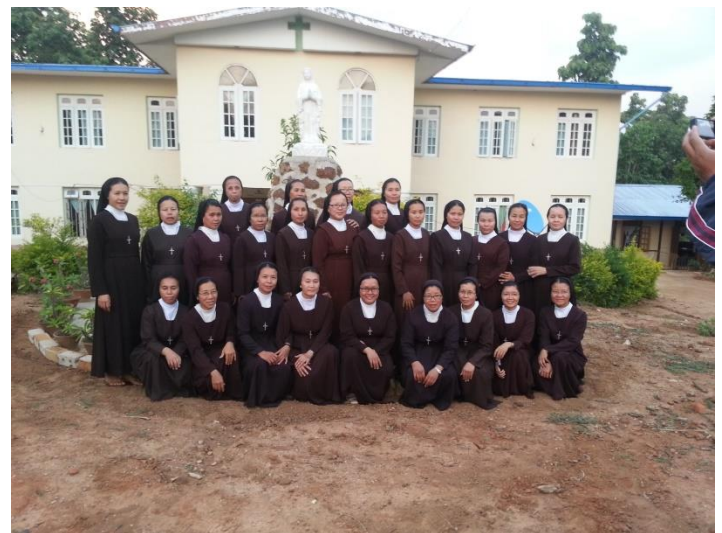
The Zetaman Sisters of the Little Flowers