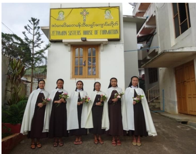
Perpetual Professed Sisters